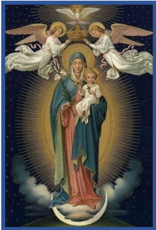
Handmaiden of the Lord,