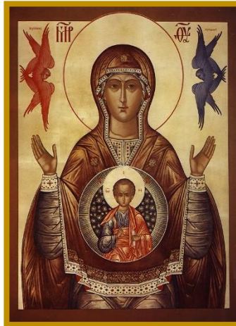
Mary of Nazareth: Mother of Jesus,