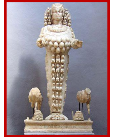
“mother goddess” “provider of fertility” “overseer of childbirth”