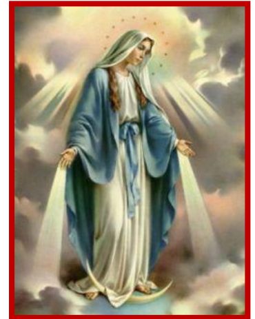
& Sorrow- Filled Mother