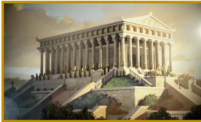
The Sanctuary / Temple of Diana /Artemis 1# of 7# Wonders of the Ancient World