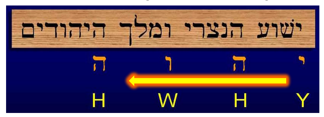
in the Hebrew Language is "YHWH"

This is the Highest Holy Name for God in Judaism & is referred to as the "Tetragrammaton". "YHWH" is 4 letters standing in the place of His Holiest Name, which may not be spoken, but only spelled with consonants - "Yahweh"